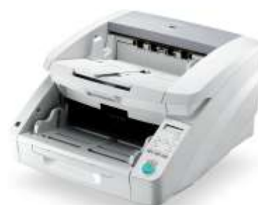
Image Formula DR-G1100

Double-sided pages fly through this scanner in a single pass thanks to intelligent systems that detect and manage anomalies in media, size and skew.