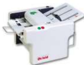
Ozfold A4 Folder