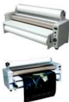
PHE 800/1000 ROLL LAMINATORS