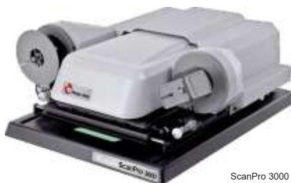
ScanPro 3000 Shown with Combination Fiche, and Motorized 16/35mm Film Carrier

With standard features that are anything but standard, the ScanPro® 3000 microfilm scanner utilizes proprietary and patented technology to offer the industry's only 26 megapixel camera and the FOCUS-Lock™ feature, which provides continual image focus during changes in optical zoom with no patron intervention needed. Pair this with ABBYY® Fine Reader optical character recognition (OCR) software, which converts images into editable documents with unmatched speed and accuracy, and you've got the fastest, most effective and best image-producing scanner on the market. The ScanPro 3000 will handle any kind of microfilm quickly and easily, with tools you won't find anywhere else, including: