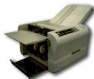
PF220 A3 Folder