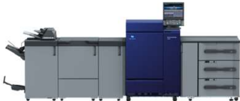
Bizhub Production Printing Press

The Multi-Jet series of plastic 3D printers are ideal for creating durable, high-definition functional prototypes, rapid tooling such as injection moulds and casting patterns, and end-use parts right in your office.