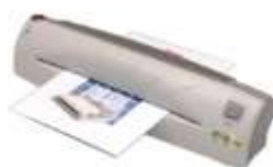
Gold Sovereign GSA4/A3