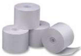
THERMAL PAPER ROLLS

We stock and have a large range of cash drawers and replacement inserts to suit all Registers including Sharp, TEC, Casio. Call us for a competitive quote!