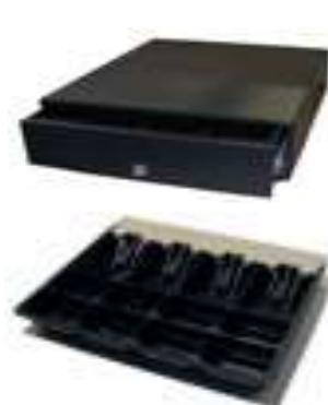
CASH DRAWERS & INSERTS

We stock and have a large range of cash drawers and replacement inserts to suit all Registers including Sharp, TEC, Casio. Call us for a competitive quote!