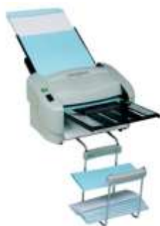
Martin Yale 7400 Folder