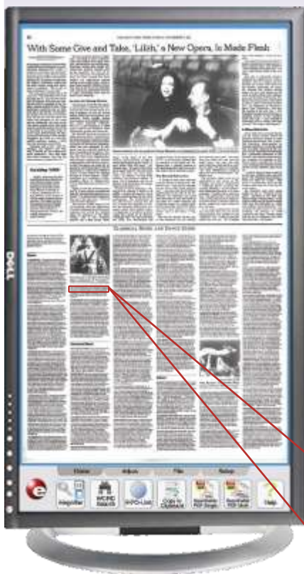
24" LCD Monitor (optional) shown with Ultra High Definition newspaper Image

A Picture is Worth a Thousand Words. Make Sure You Can Read Them.