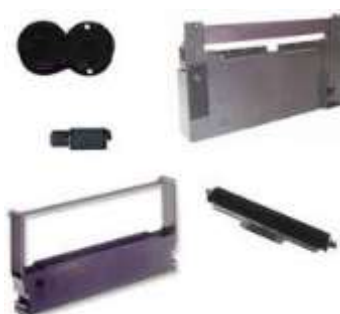
INK ROLLERS & RIBBONS

We stock and have a large range of Plain and Thermal rolls to suit all Registers including Sharp, TEC, Casio. Call us for a competitive quote!